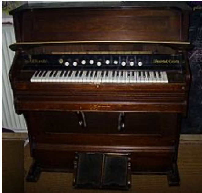
A harmonium or pump organ

In "Music for a Found Harmonium" Jeffes uses a transitional chord with a "tritone" to bridge two sections of the song: B-Section to C-Section