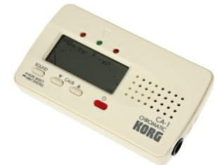
Korg CA-1 or CA-2