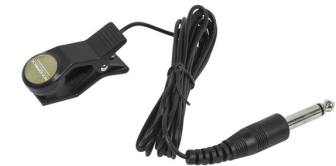
Clip on Pickup