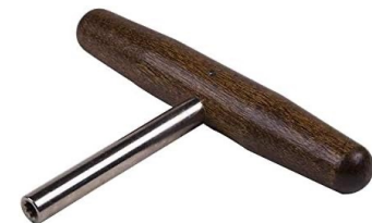
Cliff prefers “T” Tuning wrenches